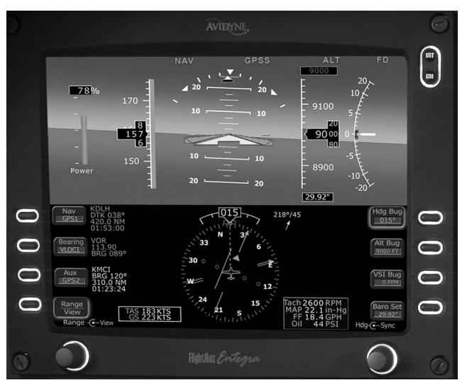
Figure 2-2. A typical primary flight display (PFD)

the TAS is correspondingly low. The pitot lines need to be cleared; applying pitot heat may or may not help at this point. (PLT524) — FAA-H-8083-6