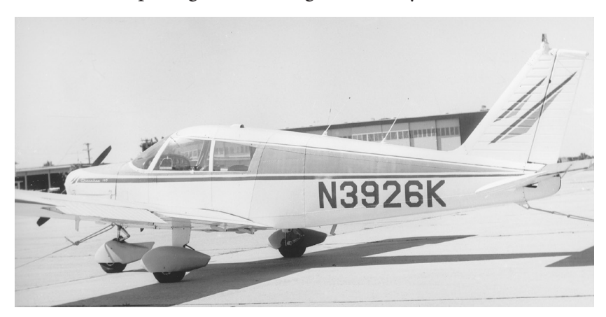
Figure 1-2. The Piper Cherokee 140 is an excellent first aircraft.

How many seats do you need? Check your logbook again and see how many times you flew with only one other person. It is probably much more often than the number of times you took your whole family. More than two small children? Better settle on a two seater. You won't be able to afford a six seater and who would you leave behind? On the whole, it is a relatively simple matter to find an economical, reliable airplane that will carry two couples or a family of four with a minimal amount of baggage. This is the key to the success of the Skyhawk and the Warrior, and the Cherokee 140 can fill the bill better than most pilots realize. But for more than four seats the price goes out of sight for many of us.