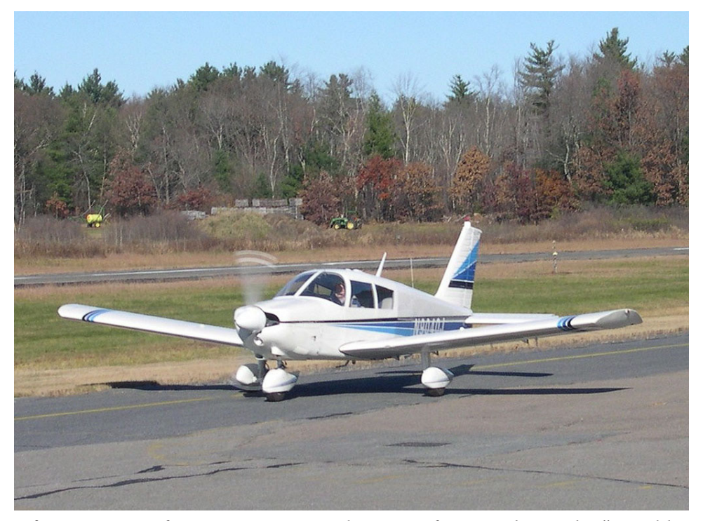
Figure 1-1. If you are an active pilot, aircraft ownership is the "possible dream."

The cost of owning and operating an airplane is further broken down into two categories. The first (indirect expense) is independent of the number of hours flown. The second (direct expense) is the actual cost of operation. There would be no direct expenses if the plane were never flown.