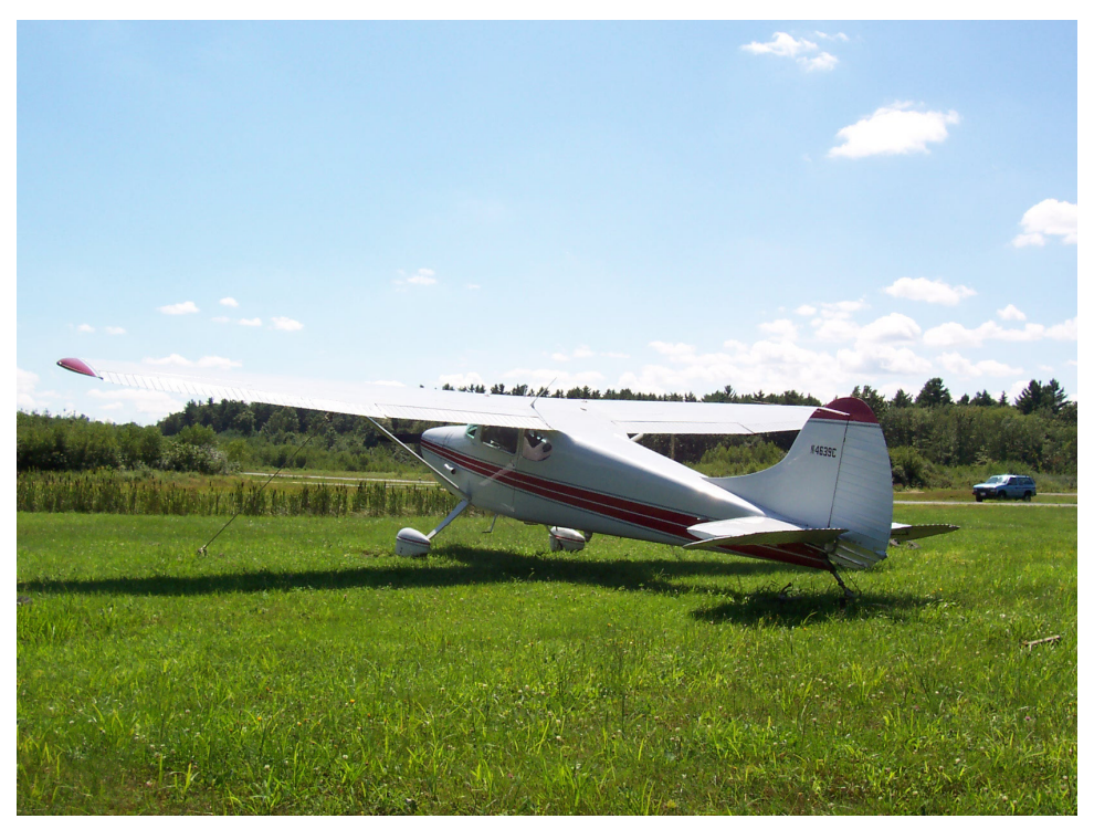
Figure 1-3. Taildraggers are fun to fly but should be approached with caution by pilots trained in tricycle gear aircraft.

The long-term costs of maintaining an older airplane at many large metropolitan fields may far exceed the cost of maintaining a 10-, 20-, or even 50-year old version still in production. A variety of factors are involved. Older aircraft may have been built with different construction methods, such as wood or steel tube and fabric, not used in most modern production types. It may be difficult to find mechanics who are capable of making high-quality repairs to wood or fabric-covered planes. Even if contemporary construction techniques are used, mechanics may be unfamiliar with the model. You will end up paying for the time a mechanic takes to learn the subtle differences in your airplane. However, maintenance of specific older types may be much less expensive at smaller fields where the mechanics may have the specialized knowledge and skills required. One fairly reliable indicator is the number of similar aircraft at the field. If Cubs, Champions, Huskys, and other ragwings abound, your odds are pretty good that there is a mechanic around who "knows fabric."